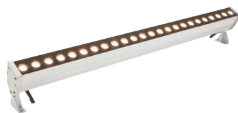
LLW32-WW LED Linear - 32W 3300K / 1700Lm 31.5"L x 2-3/16"W x 5"H