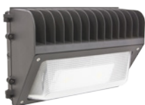
WP-R1-40-DB Rectangular COB1 4000K / 33W 2000Lm