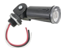
PC-120 (120V AC) PC-277 (208-277V AC) Dusk to dawn pencil photocell for 1/2" NPS hole