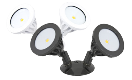
ALV2-2H-DB (Dark Bronze) ALV2-2H-WH (White)

Panorama Sunset Double 3000K / 15.9W / 1144Lm