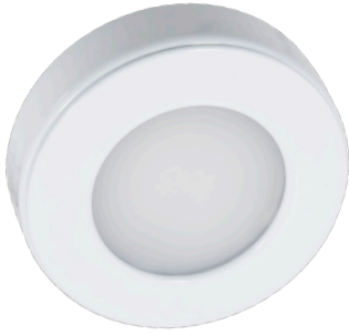
Tunable Omni Round - White 2.8W / 135Lm OMNI-TW-R1-WH