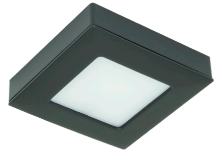
Tunable Omni Square - Black 3W / 140Lm OMNI-TW-S1-BK

Tunable Omni Single Pucks Include: (1) Omni tunable puck with 72" lead wire / Mounting hardware