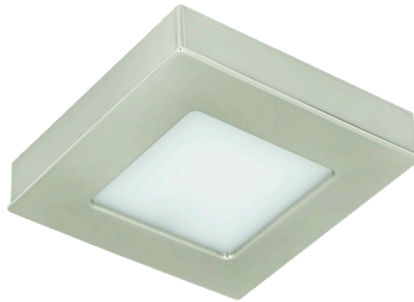
Tunable Omni Square - Nickel 3W / 145Lm OMNI-TW-S1-NK