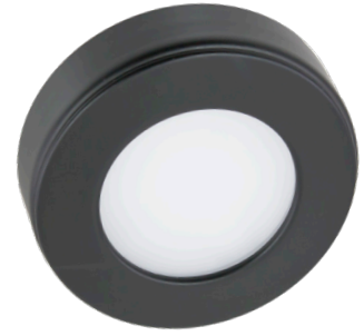
Tunable Omni Round - Black 2.8W / 126Lm OMNI-TW-R1-BK