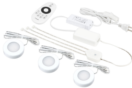
Tunable Omni Three Puck Kit - White OMNI-TW-R3-WH