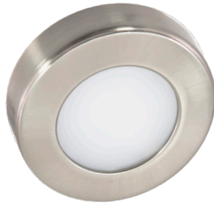
Tunable Omni Round - Nickel 2.8W / 130Lm OMNI-TW-R1-NK