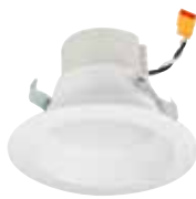
NLPR-442 4" Baffle WW, BZBZ