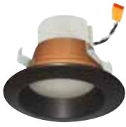
NLPR-441 4" Reflector WW, BZBZ