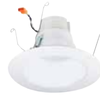
NLPR-5641 5 1/6" Reflector WW, BZBZ