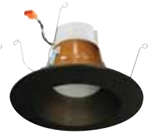
NLPR-5642 5 1/6" Baffle WW, BZBZ