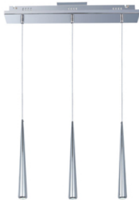
E22223-24PC Taper 3-Light Pendant