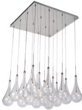
E20517-18PC Larmes 16-Light LED Pendant