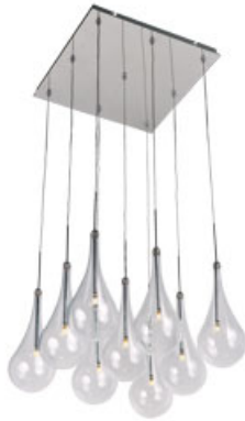
E20516-18PC Larmes 9-Light LED Pendant