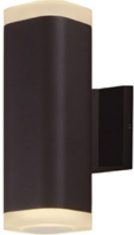
86135ABZ Lightray LED Wall Sconce