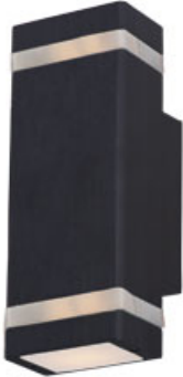
86129ABZ Lightray LED 2-Light Wall Sconce