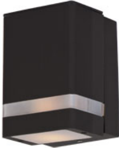
86128ABZ Lightray LED 1-Light Wall Sconce