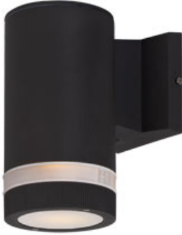
86110ABZ Lightray LED 1-Light Wall Sconce