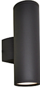
86102ABZ Lightray LED 2-Light Wall Sconce