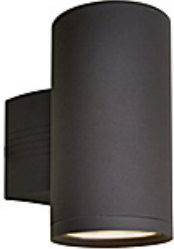
86101ABZ Lightray LED 1-Light Wall Sconce