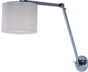
60133WAPC Hotel LED 1-Light Wall Sconce