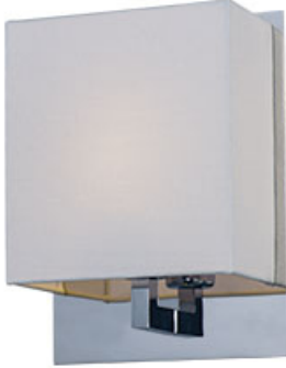
60116WAPC Hotel LED 1-Light Wall Sconce