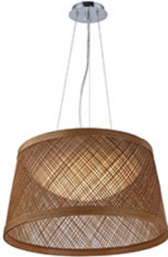
54376NA Bahama 1-Light Pendant