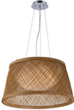
54374NA Bahama 1-Light Pendant