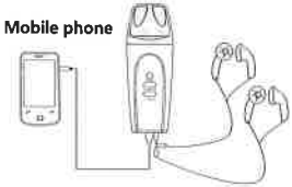
Connect Mobile phone