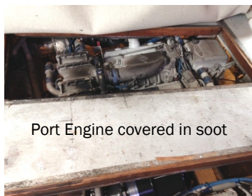
Port Engine covered in soot

When the boat docked, the passengers quickly departed and the firemen came aboard, with a fire hose. They cautiously opened the engine hatch and quickly snuffed the fire. They had no critical comments about what had transpired or how the situation had been handled.