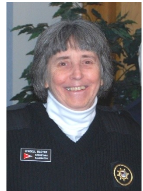
KSPS Commander Lyndell R. Bleyer

Fifty-one percent of the continental U.S. - primarily in the central and western regions - is in moderate to exceptional drought. River flooding is likely to be worse than last year across the country, with the most flood potential in North Dakota. For an interactive lake water site go to http://www.glerl.noaa.gov/data/now/wlevels/levels.html