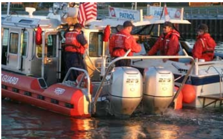
Photo: Members of the United States Coast Guard, the Coast Guard Auxiliary and United States Power Squadron work closely together to keep boaters safe through vessel safety checks.