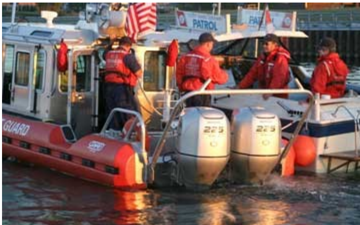
Photo: Members of the United States Coast Guard, the Coast Guard Auxiliary and United States Power Squadron work closely together to keep boaters safe through vessel safety checks.