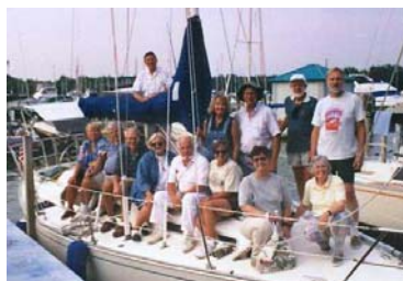
Kalamazoo Sail & Power Squadron members on a squadron event in the North Channel

The Kalamazoo Sail & Power Squadron (KSPS) is a unit of United States Power Squadrons® (USPS), a nationwide non-profit organization of boating enthusiasts, both power and sail, dedicated to promoting boating safety and education. The USPS is comprised of 33 districts: unions of different local squadrons in a general area of coverage. KSPS belongs to District 9 along with 24 other local squadrons, each one dedicated to providing boating education to the Lower Peninsula of Michigan and northern Indiana.