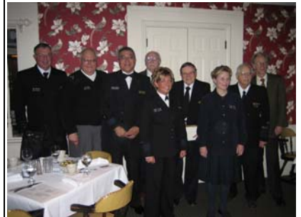
The 2006 Kalamazoo Sail & Power Squadron Bridge: Thank you for taking us Back to the Future!