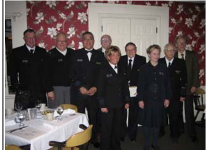
The 2006 Kalamazoo Sail & Power Squadron Bridge: Thank you for taking us Back to the Future!